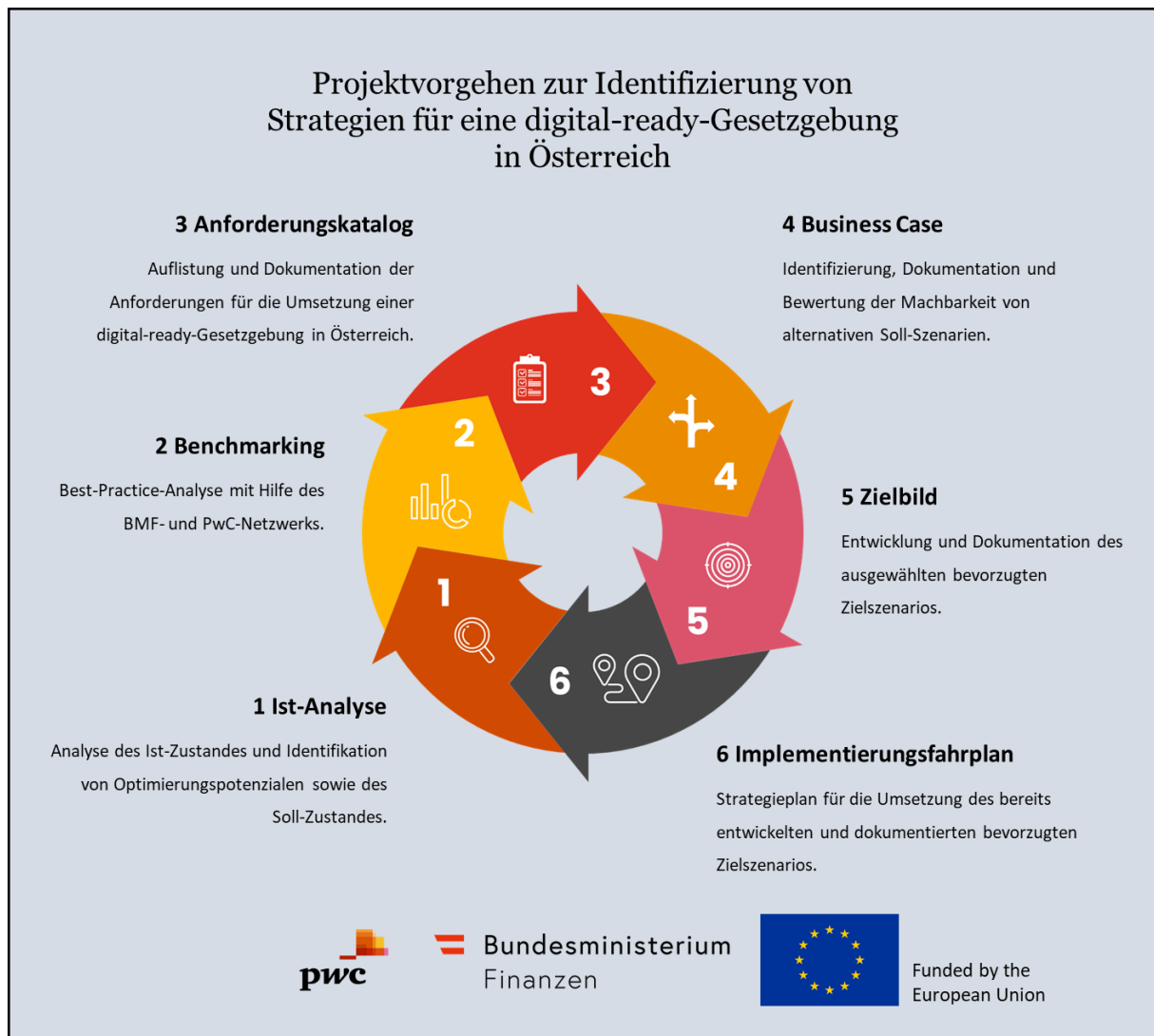
Figure 2 - Infographic: Project approach (DE)