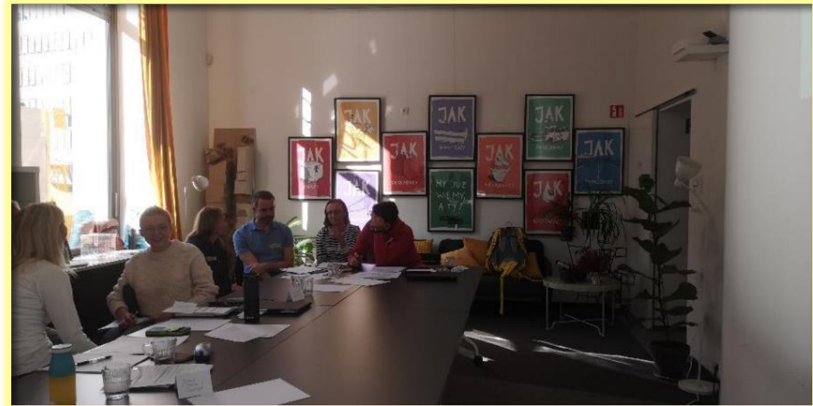
Poland, October 2023