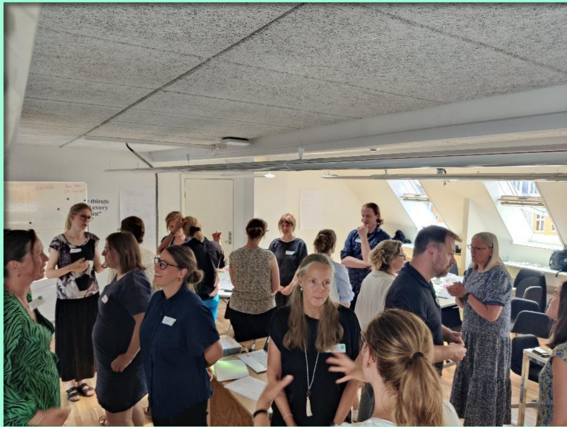
Denmark, June 2023