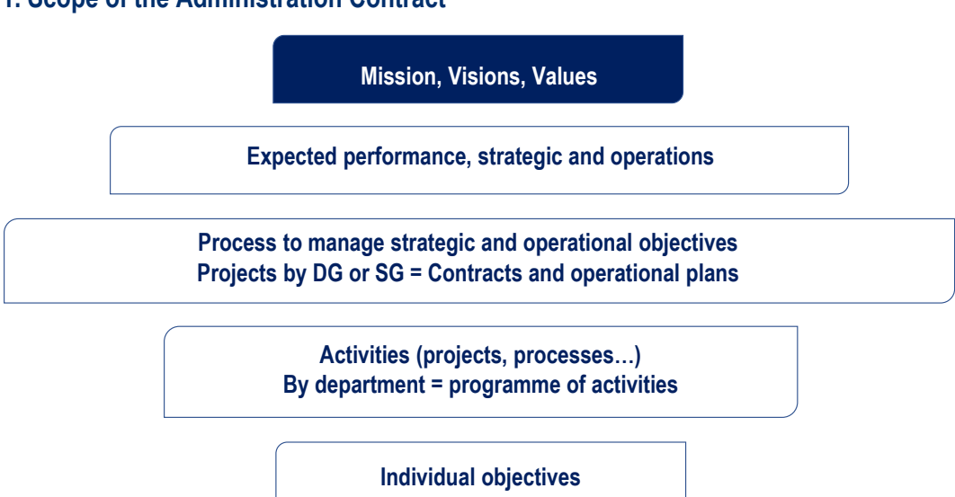
Figure 1. Scope of the Administration Contract