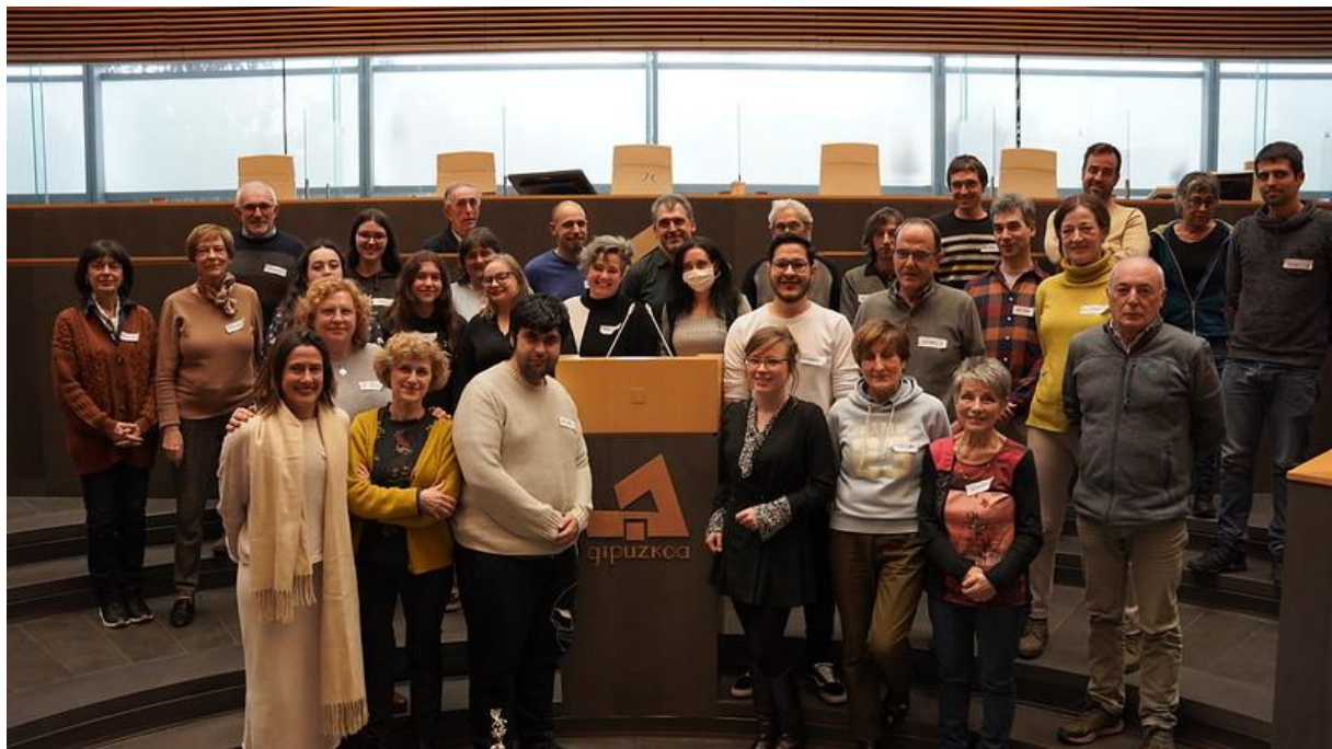
Gipuzkoa Citizens' Assembly members