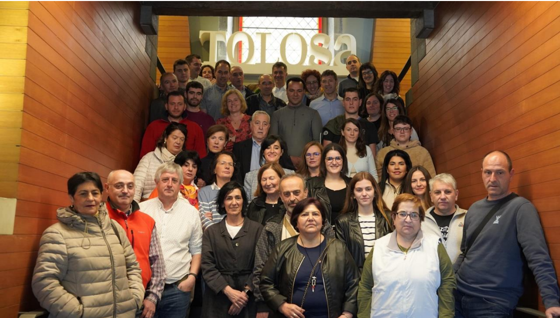
Tolosa Citizens' Assembly members, promoters and experts

The process has had an impact on people, who, after participating in it, show greater confidence in politics (politicians), democracy and participatory processes.