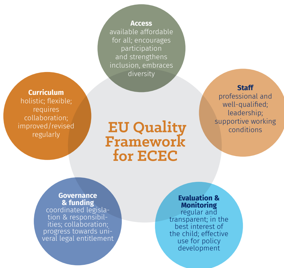
Figure 2. The EU ECEC Quality Framework

Each key finding includes a brief description of an ECEC challenge identified during the evidence generation phase of the project, which is accompanied by suggested actions to address the challenge. In addition, for each key finding, the source(s) for the identified challenge and the suggested actions is/are also indicated.