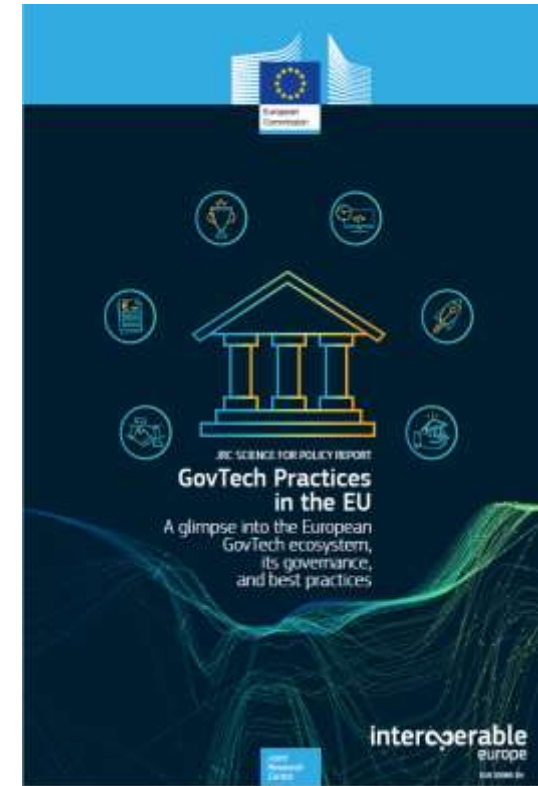
Science for Policy Report