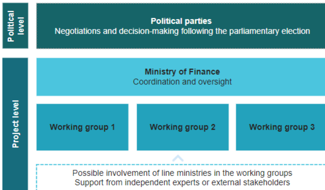
Figure 2. Organisational structure for comprehensive spending reviews

The organisational structure is designed based on Finland’s successful model in the Spending review 2023, which emphasises the MoF’s central position with minimal organisational layers. In this structure, MoF assumes a pivotal role throughout the whole process, overseeing and coordinating the process and potential input of stakeholders as well as analysing and developing policy options.