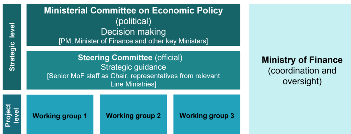
Figure 1. Recommended organisational structure for targeted spending reviews.

Political decision-making body. In the Finnish context, we recommend the Ministerial Committee on Economic Policy (FI: talouspoliittinen ministerivaliokunta ) to be the political decision-maker. Comprising the Prime Minister, Minister of Finance and other government ministers with senior experts from the MoF involved, this Committee oversees significant decisions related to economic planning, fiscal policy, and resource allocation. 9 Therefore, the Committee would be well-suited to serve as the political decision-making body in the spending review process.